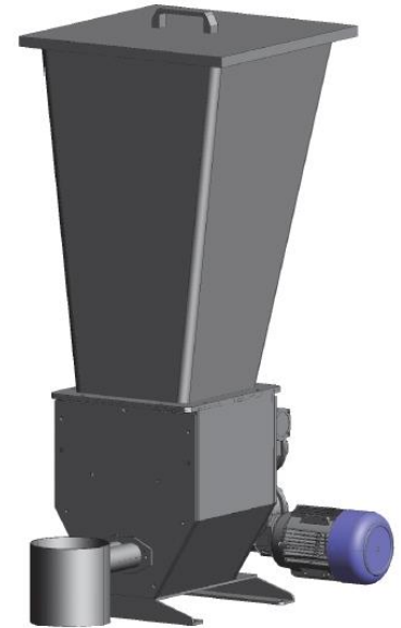
TWIN40 mit 70-Liter-Trichter und horizontalem Austragrohr

The SCHOLZ-CON-TRUST control system enables single- and multi-component operation.